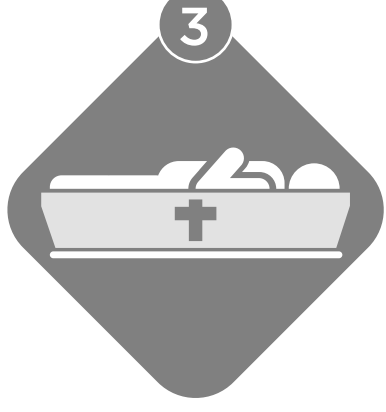
Upon your death

Contrary to popular belief, estate planning is about more than providing for your family after you're gone. A proper estate plan should be put in place as soon as possible so that you maintain complete control over your property and finances during three crucial times: